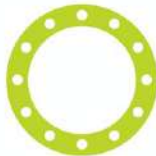
Confined space entry