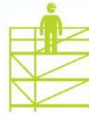
Working at heights